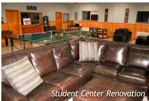
Student Center Renovation