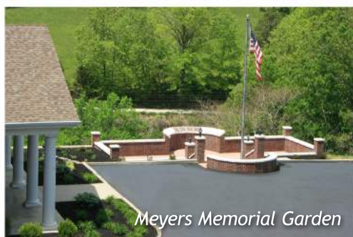
Meyers Memorial Garden