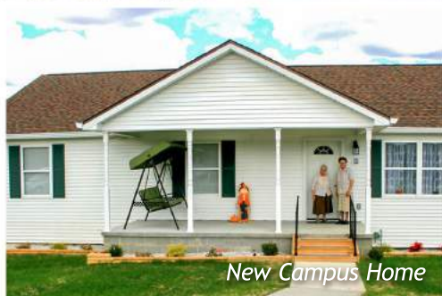
New Campus Home