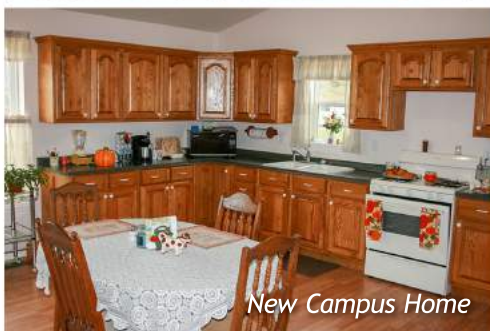
New Campus Home