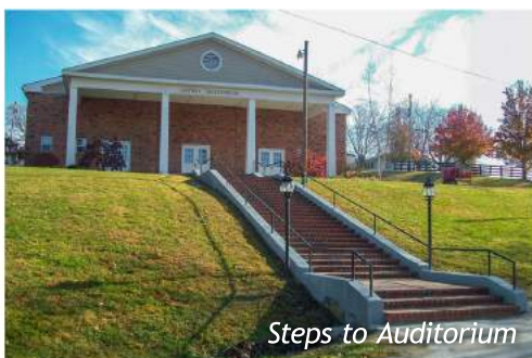
Steps to Auditorium