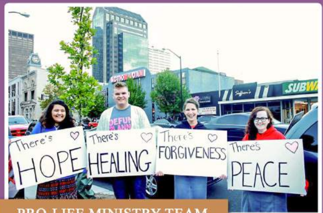
PRO-LIFE MINISTRY TEAM