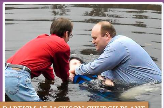
BAPTISM AT JACKSON CHURCH PLANT